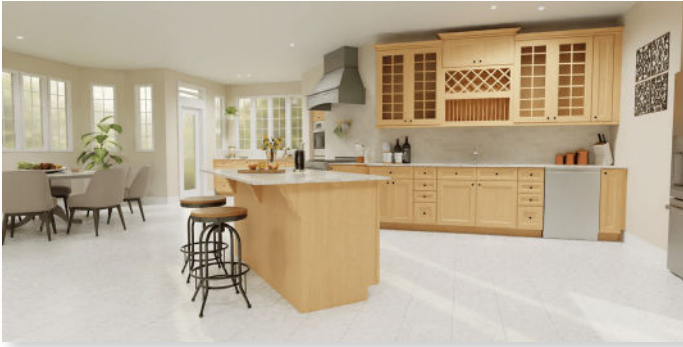
The kitchen from The Fresh Prince of Bel-Air – 3D Room Planner render

5. Pop culture content: There are a lot of ways to play with pop culture, but the specific example we want to call out is designing and merchandising rooms from famous sitcoms. Design a space similar to a popular TV show and then have people guess the show. This is a fun, easy for retailers to join a pop culture narrative while featuring real, buyable product SKUs.