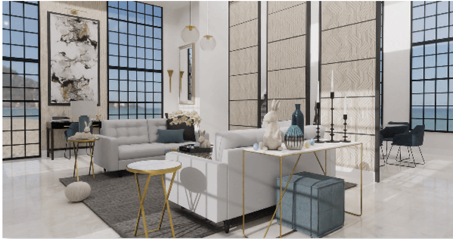
Easter egg hunt – 3D Room Planner render

3. Social media content and advertising: Renders can be used to break through the noise on social media, personalize advertising, for thematic holiday content, or to create interactive games that feature real product SKUs. For instance, a simple 'Spot the Difference' campaign can be used to engage users in finding variations between two similar rooms. When it comes to holidays, the renders can be used to create thematic content such as an Easter egg hunt, a dining room table set for Thanksgiving, or a living room on Christmas Eve.