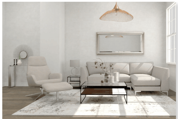
3D Room Planner Scene - Rendered