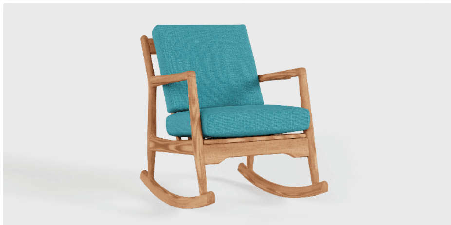
Single product render of a chair

2. Product page visuals: Single product renders can be used as product page images. Close to real, these single product renders are close to studio photography and show accurate colors, textures, and finishes. They look realistic and can completely replace photography on product pages.