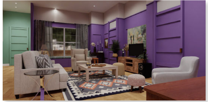
The apartment from Friends – 3D Room Planner render

Product photography was great when it was the only option – but 3D technology makes it possible to create better, more entertaining content with insane speed and efficiency. Whether sharing in social media, marketing campaigns, or creative presentations, the possibilities are endless with 3D renders.