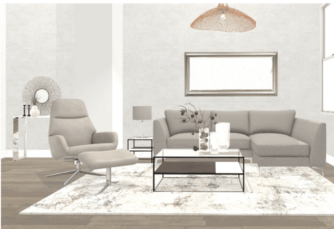
3D Room Planner Scene - Not Rendered

A 3D render is a photorealistic 2D image generated from a lower fidelity, interactive 3D scene. The 3D rendering process bakes textures, lighting, reflections, and other details into a scene to create a photo-similar image. 3D renders can be used to show how a room will look when it is fully furnished or with a completely new kitchen installed.