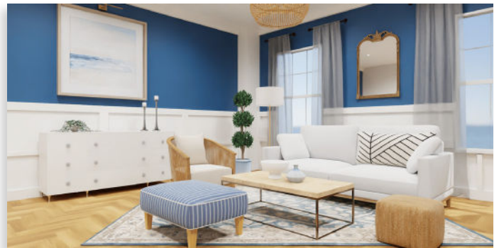
3D Room Planner render variations